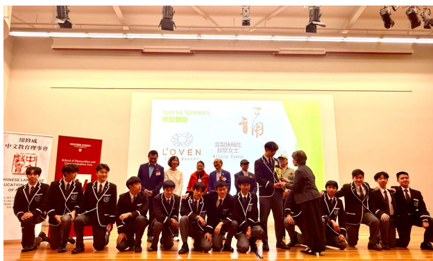
16-18 1 st prize