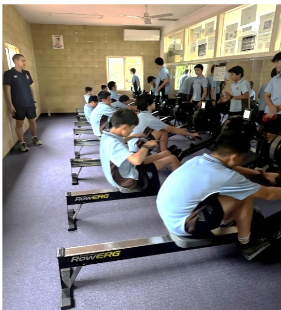
Junior and Intermediate Cross Country Runners on Rowing Machines

The boys embraced the varied training activities with enthusiasm and effort. It was inspiring to see them push themselves, demonstrating their commitment to improving fitness, building resilience, and enhancing physical literacy. Their adaptability and determination to keep progressing, regardless of conditions, was commendable.