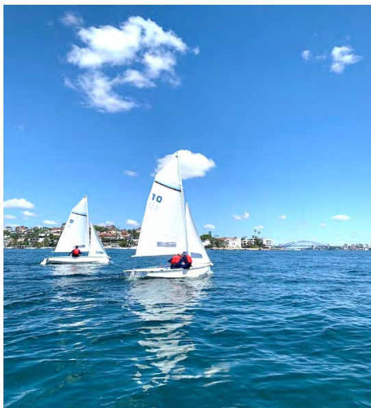
HIGH SAILING Saturday Sailing