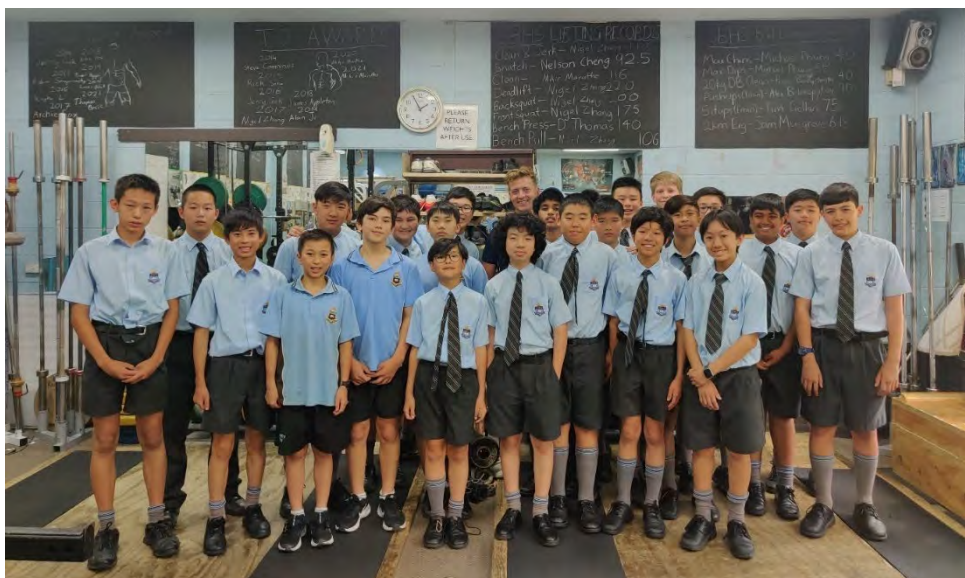
2022 Year 7 Weights room members