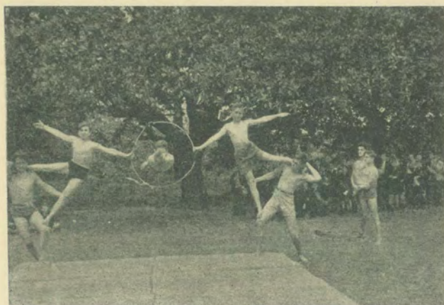
A PERFECT DIVE.