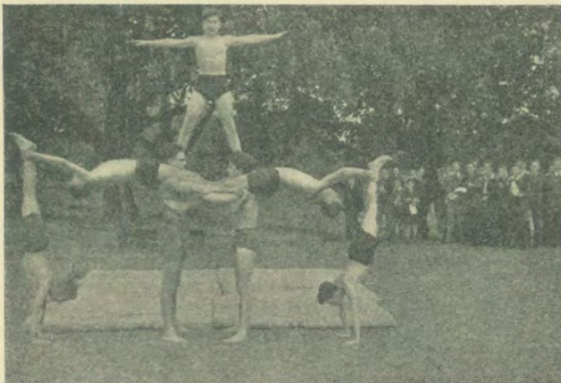
"EXERCISE AND PLAY."