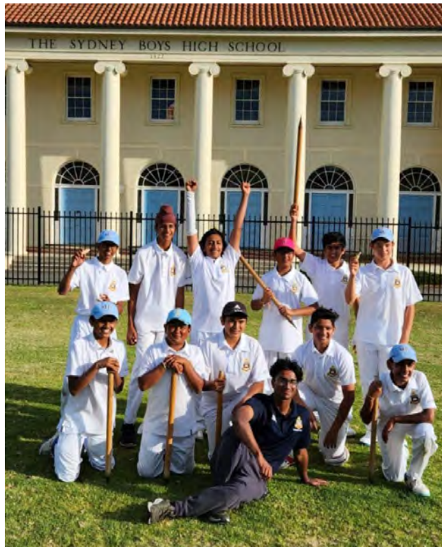
The 14A's after taking the win against Newington