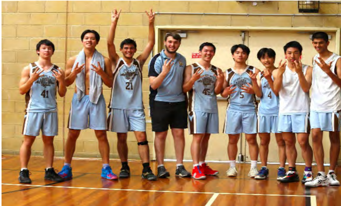
Third Grade side after their win on the buzzer