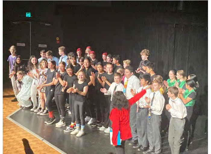
All semi-finalists take a bow!