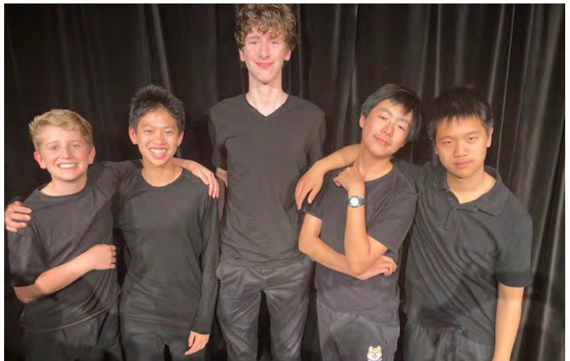
Acting is serious business: