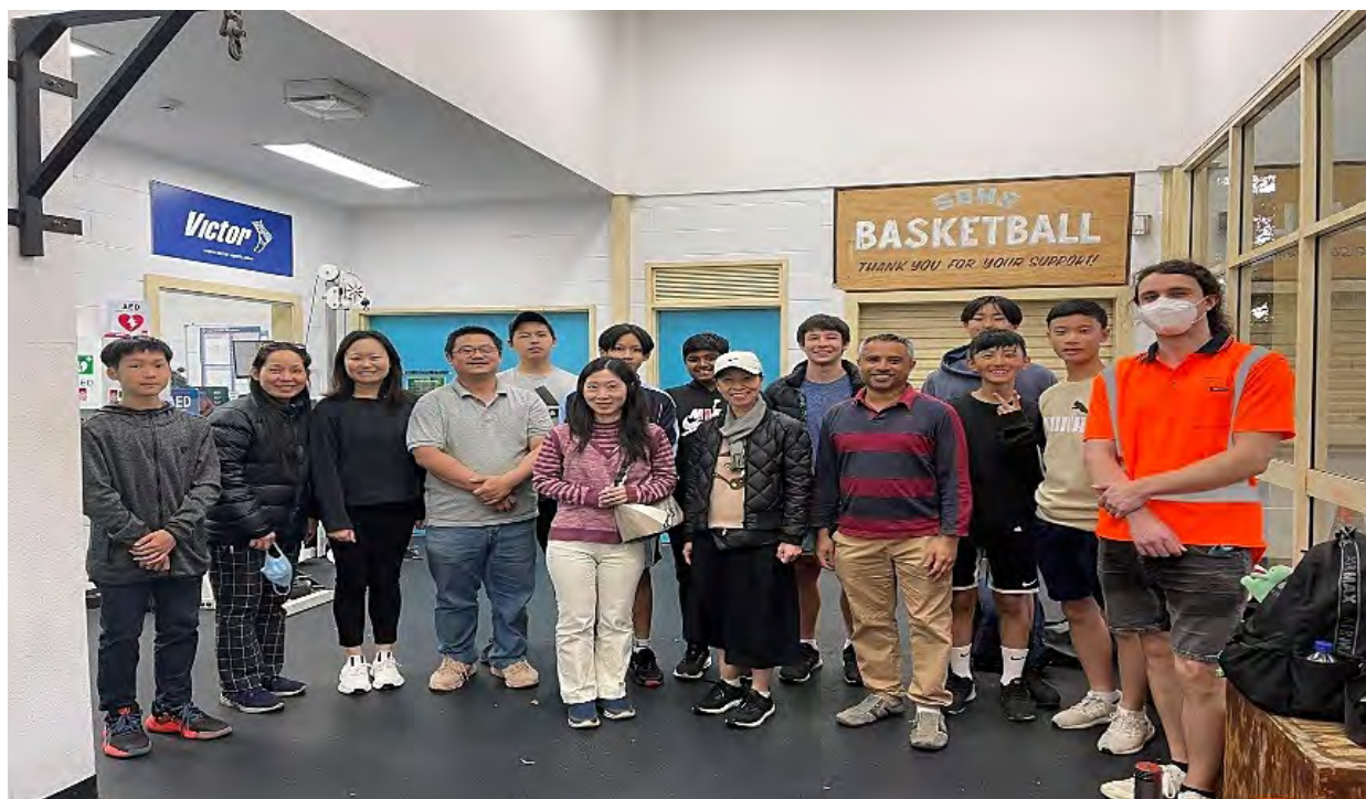
SBHS Basketball: The best car parking, canteen and fundraising groups in the school!! (names below courtesy of Rosaline Perry)