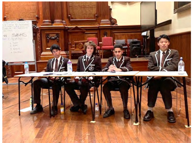
The Firsts ready to Debate