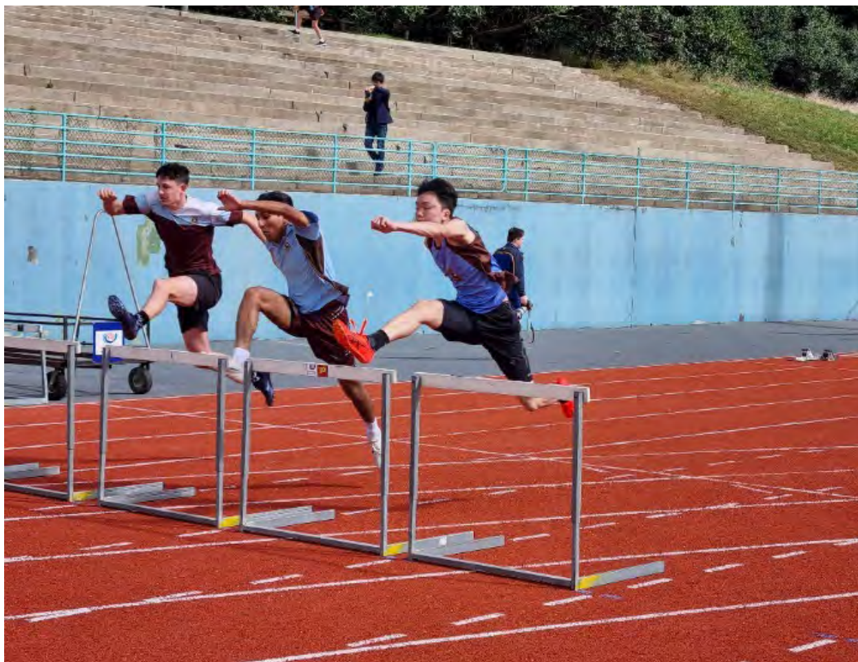
Sydney Boys High boys racing off at the last invitational