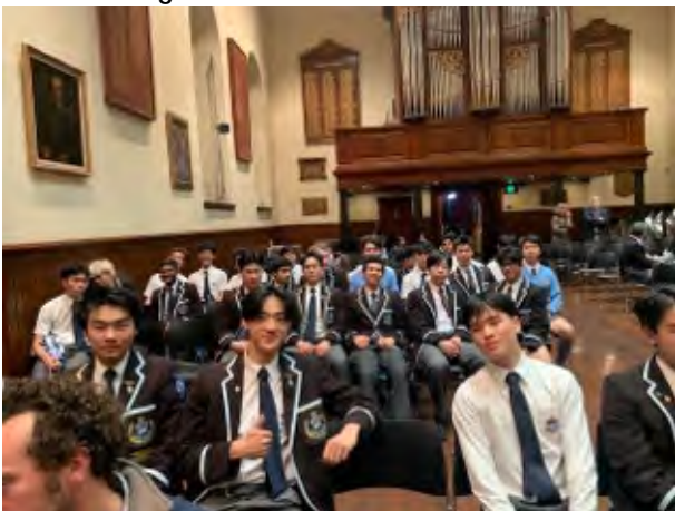
Supporters at Grammar