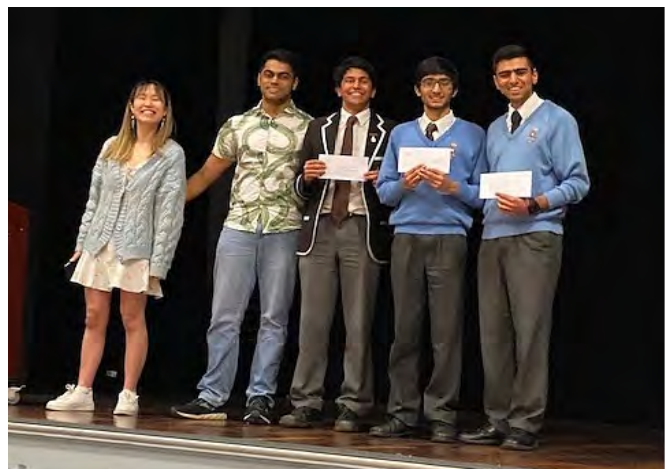
Opens Awards Winners with coaches