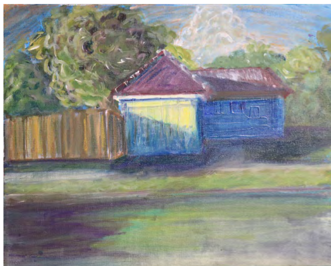
Jennifer May Head Teacher Art

Ryan Liang's expressive landscape painting depicts a familiar suburban scene and explores the contrasts between the built and natural environment. The artwork moves dynamically between the flat structures of rooftops, fences and roads to the organic and moving surfaces of bushland and the open sky. There is a strong sense of atmospheric light depicted within the work that highlights key features of the artwork's composition and Ryan's choice and application of colour. Ryan's energetic and diverse use of mark-making enliven the surface of the work and provide a sense of movement to what is often a still scene. Well done to Ryan for producing a dynamic and energetic artwork.