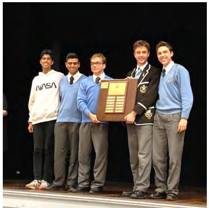
Winners of the Joseph Suttie Award The GPS Thirds