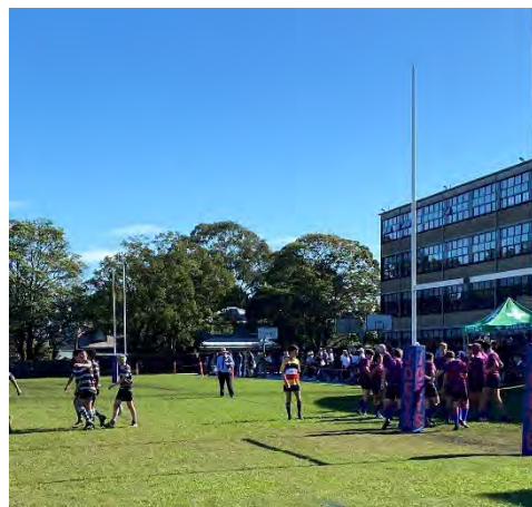
14/15 scoring and returning to face the kick