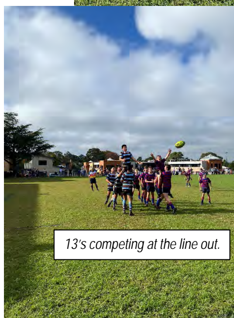
13's competing at the line out.