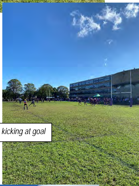
14/15 kicking at goal