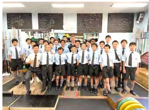
2020 Year 7 Weights Room Members