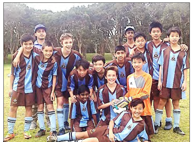
13Bs celebrating their first win for the season

Congratulations to the 14Es who managed to secure a 0-0 draw and maintain their undefeated pennant and take out the Dolan Cup.