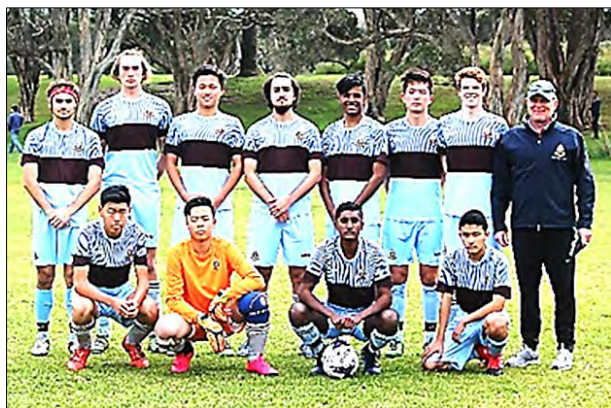
SBHS 1 st XI Football 2017

We have now come to the conclusion of the 2017 Football GPS Season. I would like to thank all our coaches, staff, students and parents for another wonderful season.