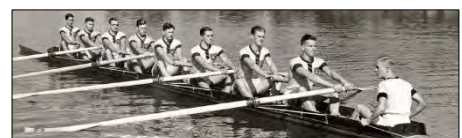
Sydney Boys High School Team. Ca. 1925 - 1940