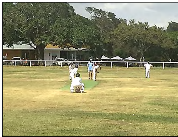
14Bs against SGS earlier in the season