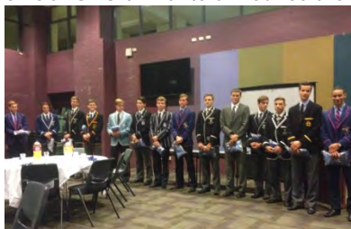
GPS Combined Football Team 2015