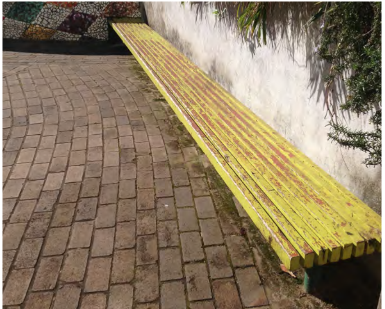
The Seats need sanding and painting