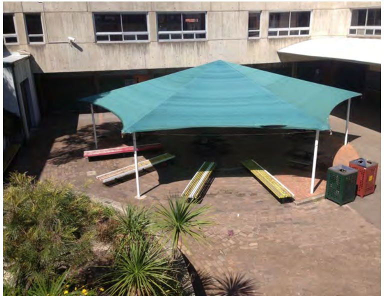
The COLA Space- the ground plane is filthy