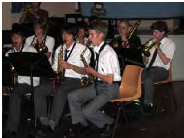
The French Tour Stage Band