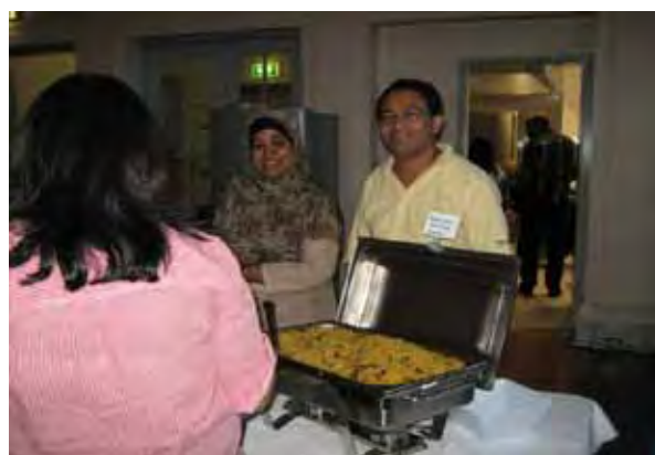
Parents and Produce - food from the four corners of the world.