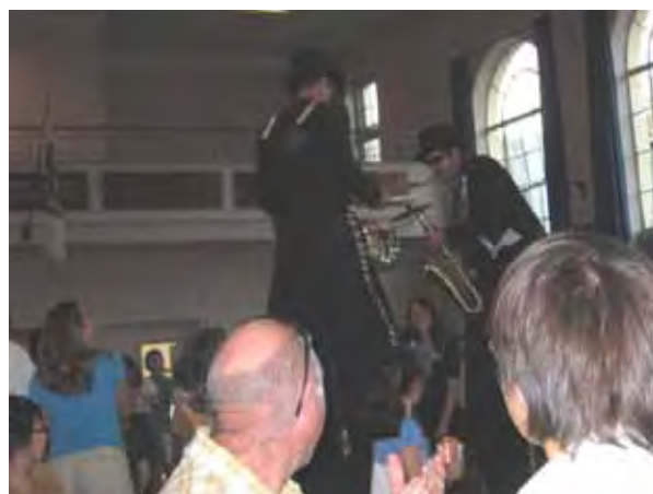
Music from Above - two musicians on VERY high heels!