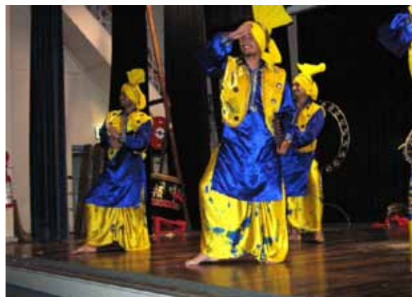
The Merry Men From India - the Bhangra Dance Troupe