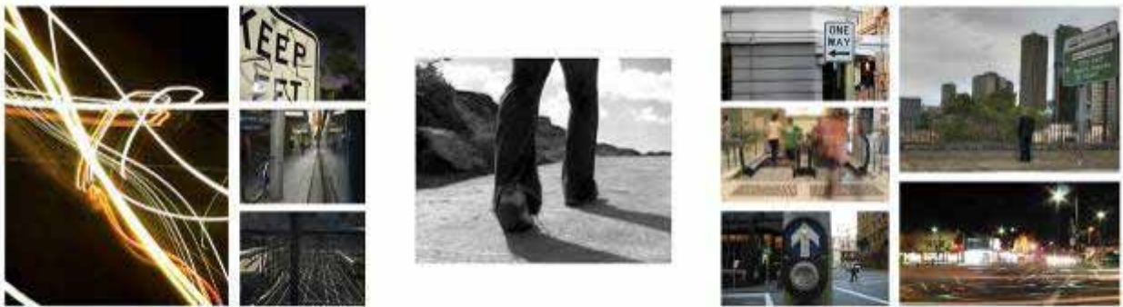
Ashwin Thomas "In Transit" sculptural installation [video and photography]