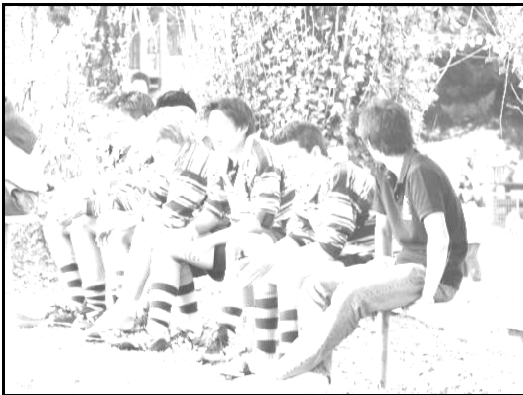
On the bench