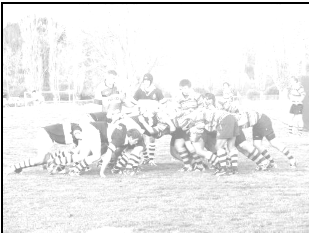
First Fifteen scrum at Armindale